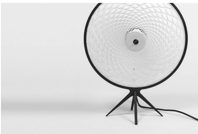
SOL by Jona Messerli

Young Swiss designer Jona Messerli presented SOL – a Japanese-inspired lamp, which "allows the sun to continue shining indoors". The table lamp, which is sculptural in nature, is flat-packed and can be assembled quickly. Thanks to a unique cutting pattern, two layers of tear-resistant "MADOCA" shoji paper are stretched and mounted around the illuminant creating magical lighting.