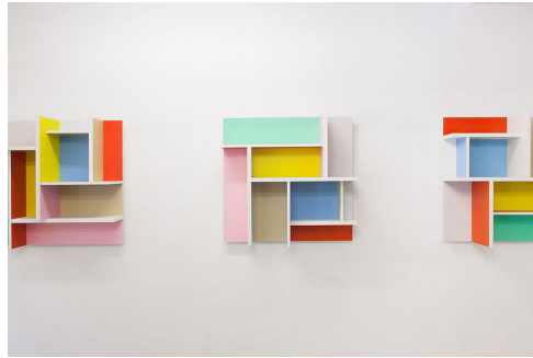
Pico Balla by Zak Lux

Young Swiss designer Jona Messerli presented SOL – a Japanese-inspired lamp, which "allows the sun to continue shining indoors". The table lamp, which is sculptural in nature, is flat-packed and can be assembled quickly. Thanks to a unique cutting pattern, two layers of tear-resistant "MADOCA" shoji paper are stretched and mounted around the illuminant creating magical lighting.